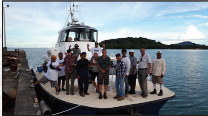
C4L crew and Vital personnel with contractors V&B and the Adams Brothers, conducting a site visit to Ichimanton, Tonoas.

Inter-island transportation is expected to become available to staff and the public as early as January 2019.