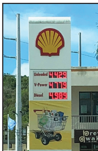
Prices at a Service Station in Tamuning, Guam on May 16, 2018