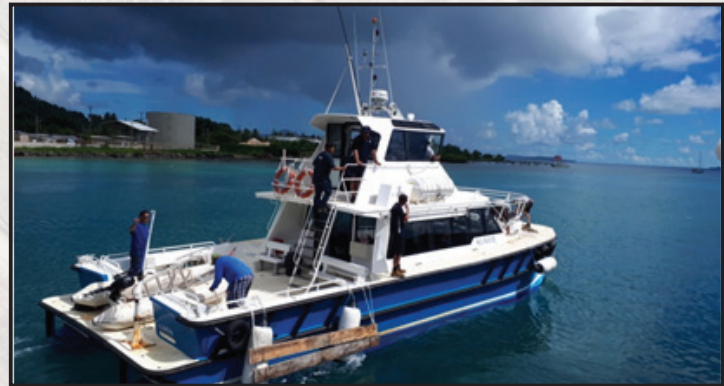
The Rob Benn Team and C4Life crew conducted various training exercises and test runs of the vessel.