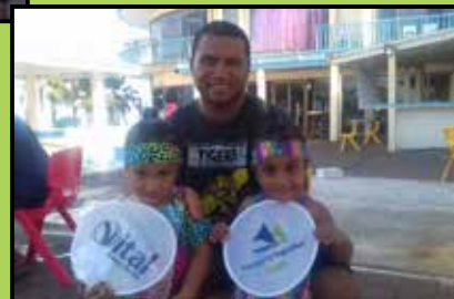
Family Fun Day for our 9th Year Anniversary celebra- tions at Menen Hotel