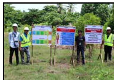
Vital employees and contractors with Safety signs