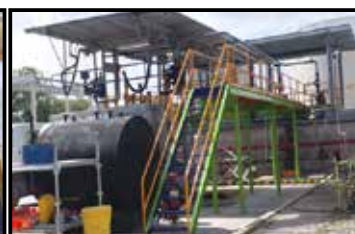
A new emergency Exit Walkway