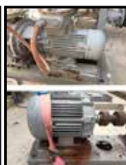
ULP & JetA1 Pump/Motor