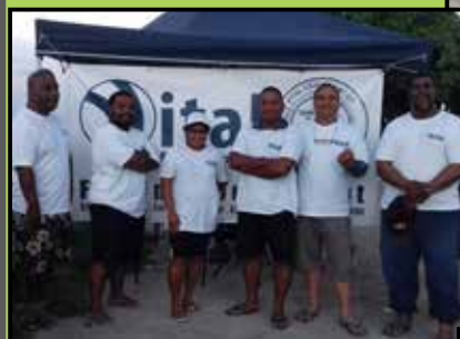
Team Nauru hosted its very first Vital Annual Fishing Circuit in September. Con- gratulations Team Nauru on a successful, record-breaking event!