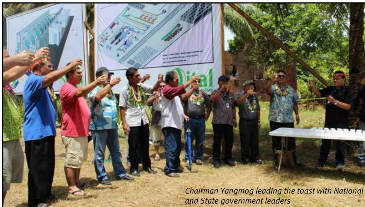
Chairman Yangmog leading the toast with National and State government leaders