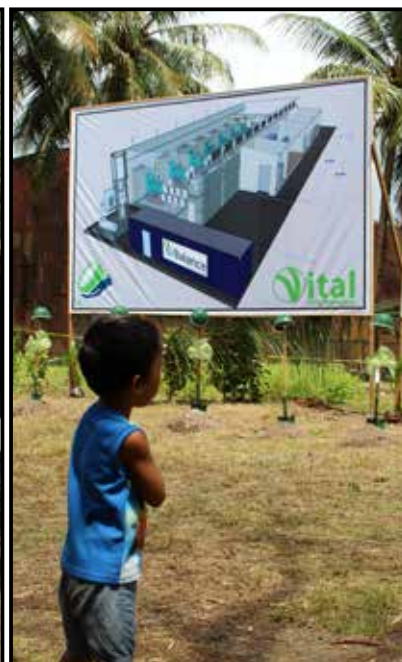
Young Tonoas citizen