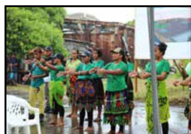
Etten Youth Group