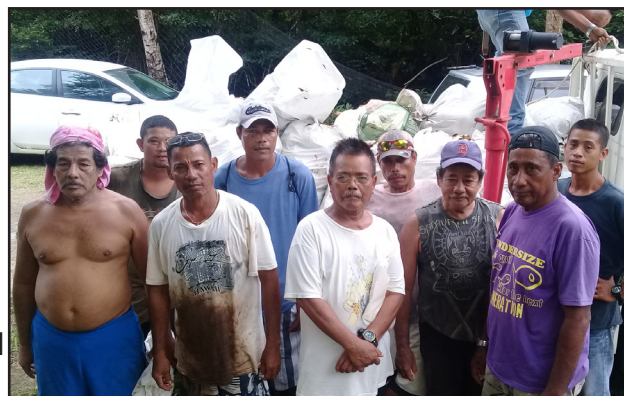
Pictured: Farmers of the Takaiau PGS

For more information on the Participant Guarantee System model and to register your community's interest to supply coconuts to C4Life, e-mail: pgs@fsmmpc.com .